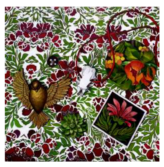
JACKLYN ST. AUBYN MEMORY LANDSCAPE , 2019 OIL ON PANEL