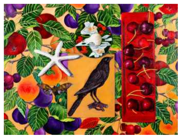
JACKLYN ST. AUBYN FRUITS OF LABOR, 2020 OIL ON PANEL