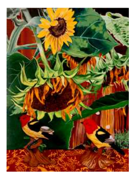
JACKLYN ST. AUBYN BACKYARD , 2019 OIL ON PANEL