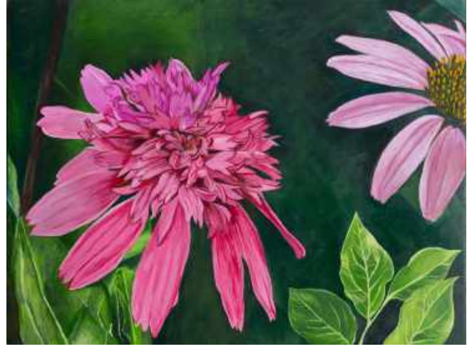
JACKLYN ST. AUBYN PINK FLOWERS, 2017 OIL ON PANEL