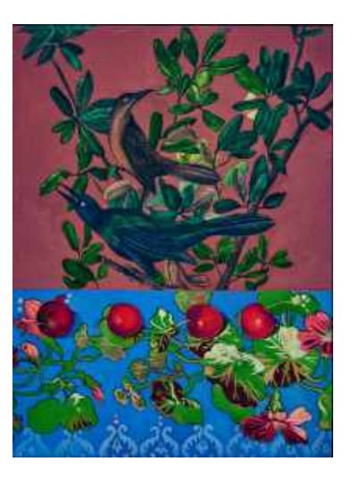
JACKLYN ST. AUBYN RAPTURE, 2015 OIL ON PANEL