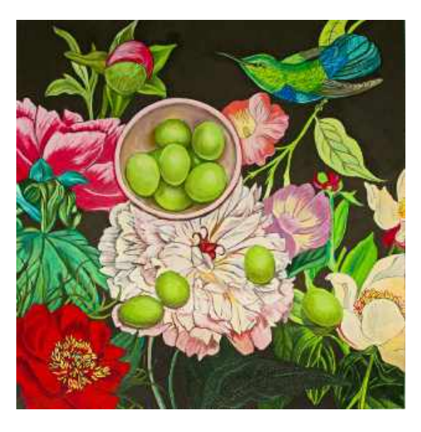
JACKLYN ST. AUBYN BOWL OF GRAPES , 2013 OIL ON PANEL