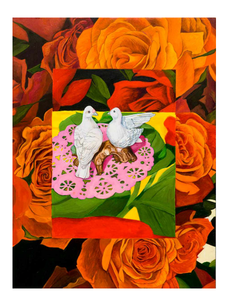
JACKLYN ST. AUBYN LOVEBIRDS, 2010 OIL ON PANEL