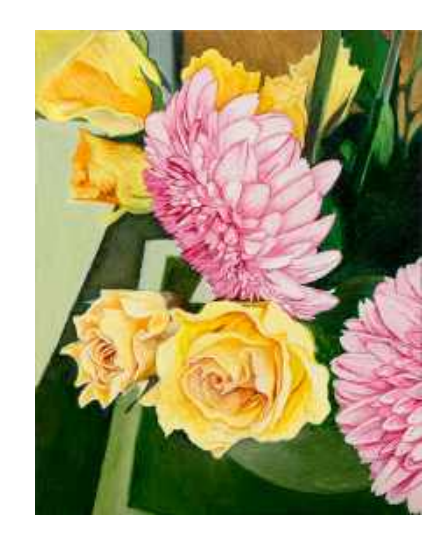
JACKLYN ST. AUBYN PINK AND YELLOW, 2017 OIL ON PANEL