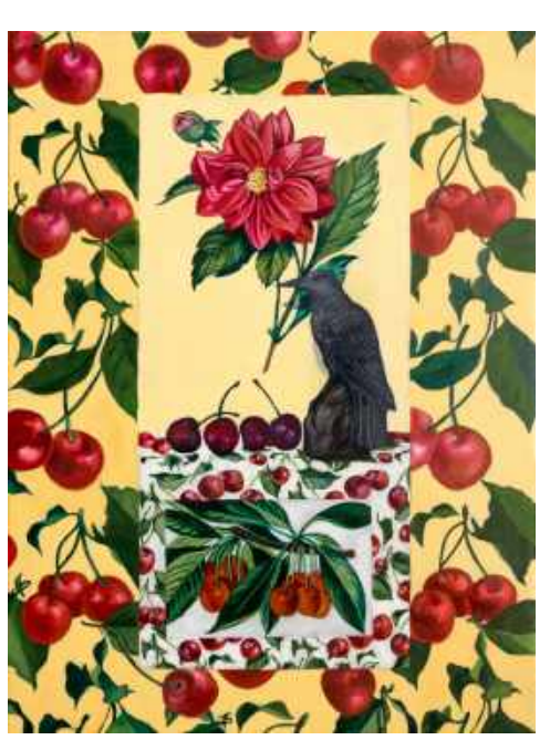
JACKLYN ST. AUBYN CHERRY UNIVERSE, 2018 OIL ON PANEL