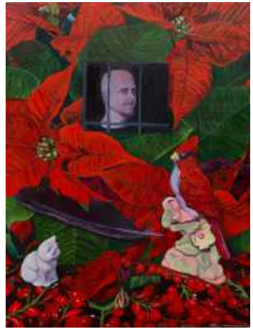
JACKLYN ST. AUBYN ROSES ARE RED, 2020 TERRA INCOGNITA, OIL ON PANEL