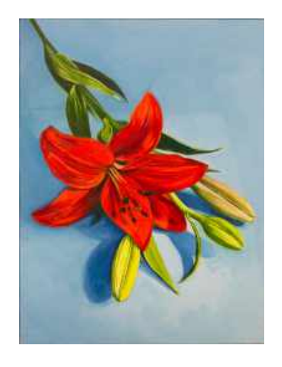
JACKLYN ST. AUBYN RED AND BLUE, 2017 OIL ON PANEL