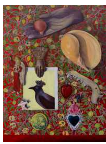
JACKLYN ST. AUBYN THE LONGING, 2020 OIL ON PANEL