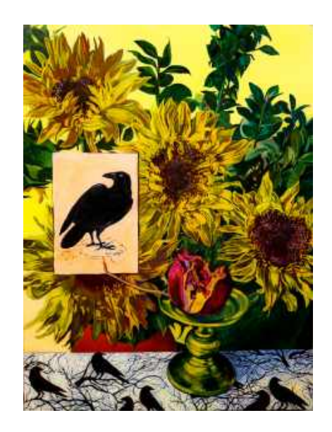
JACKLYN ST. AUBYN AS THE CROW FLIES, 2019 OIL ON PANEL