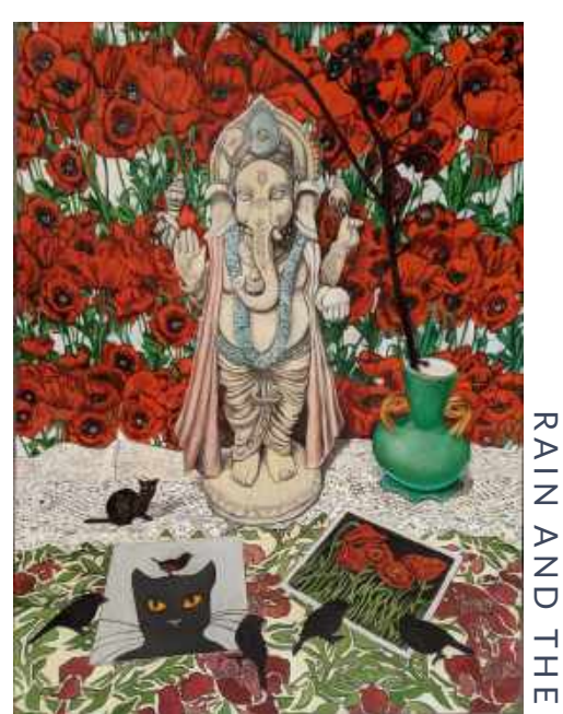
JACKLYN ST. AUBYN FIELD OF POPPIES, 2019 OIL ON PANEL