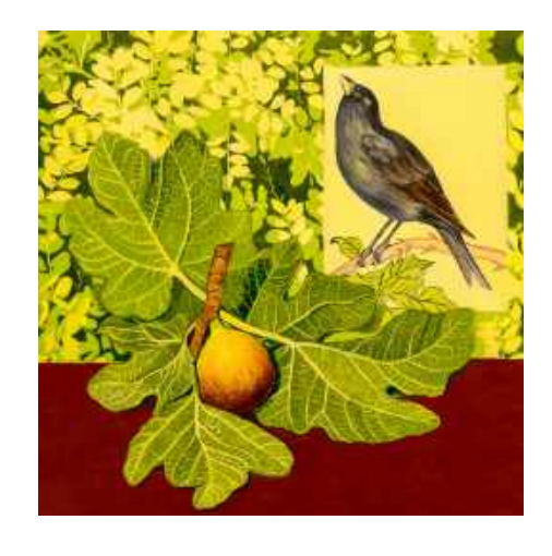
JACKLYN ST. AUBYN FIG DREAM, 2019 OIL ON PANEL