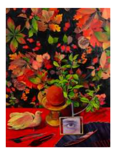
JACKLYN ST. AUBYN 2019 OIL ON PANEL