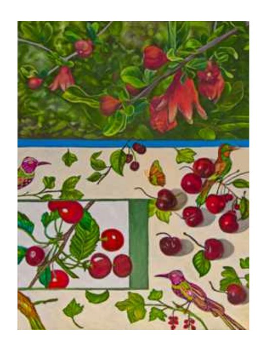
JACKLYN ST. AUBYN CHERRIES AND BIRDS, 2015 OIL ON PANEL