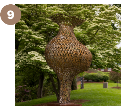
Bob Doster (SC) Trinity 2, 2020-21 Carbon infused stainless steel