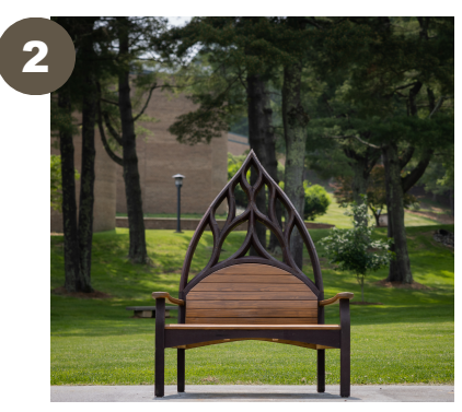
Beau Lyday (NC) The Long and Winding Road, 2022 Aged tin, wood, steel