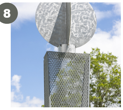
Carl Billingsley (NC) Sentinel, 2022 Galvanized steel, aluminum