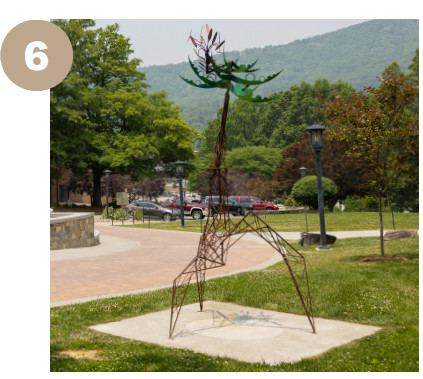
Wesley Stewart (GA) Space Flower, 2023 Painted and welded steel