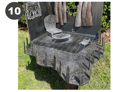
Sophia Dominici (NC) Room, 2022 Welded steel