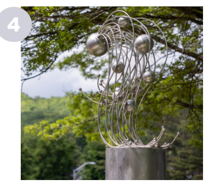
Adam Walls (NC) Maman, 2020 Stainless steel