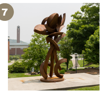
David Boyajian (CT) Butterfly Weed, 2023 Steel