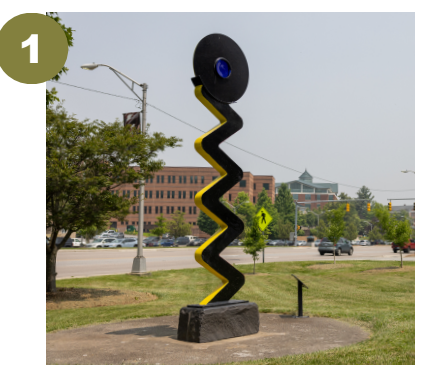
Glenn Zweygardt (NY) ZigZag Blues 03, 2021 Painted Steel, cast glass, black granite