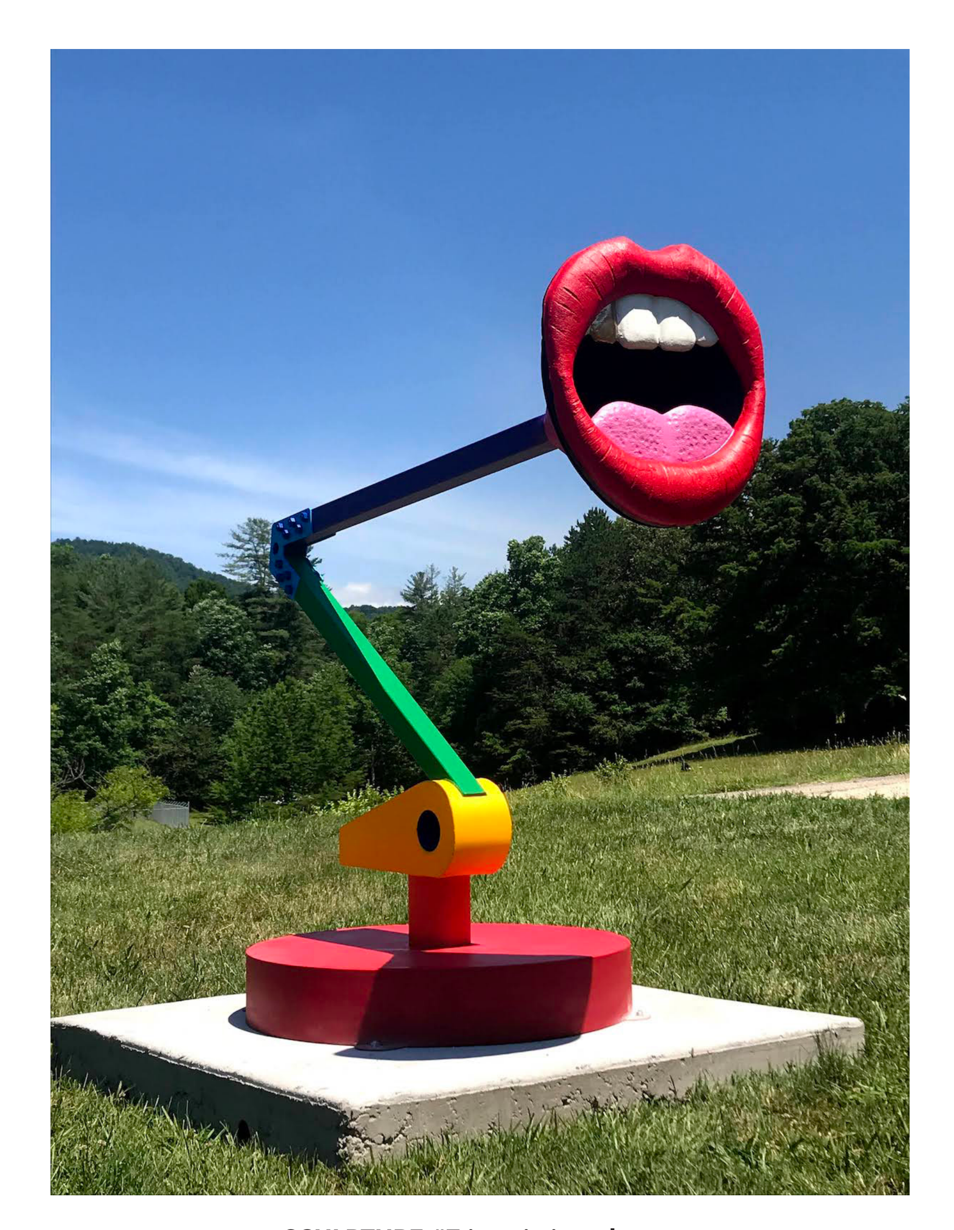
SCULPTURE #7 in existing planter