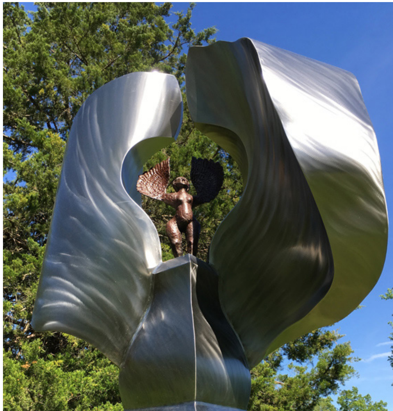
SCULPTURE #2 on artist provided base in grass

Mike Roig "Chrysalis" 10' tall x 4.5' diameter of motion Polished Stainless Steel with a base of recycled, painted mild steel elements and a figure of cast iron with recycled steel wings